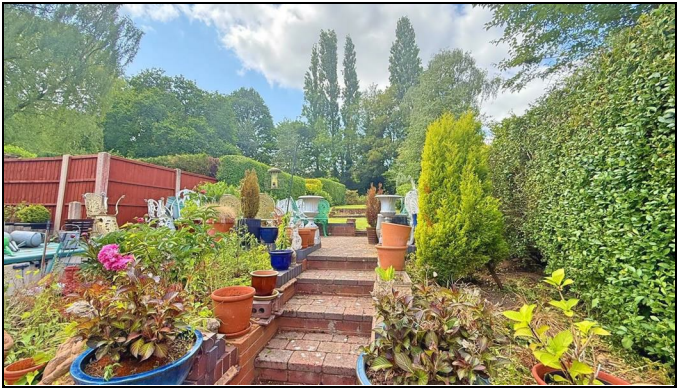
Clarence Road, Sutton Four Oaks, Sutton Coldfield, B74 4LD